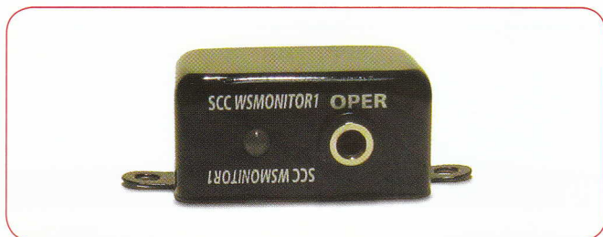
3M™ Continuous Monitor, Single Wire 1

Single wire continuous monitors offer the most cost-effective means for continuously testing the connection integrity of the entire ground loop including the person, the wrist band and the coil cord. By using new impedance sensing technology, adjustments and false alarms are virtually eliminated. This system is fully automatic and activates when a wrist strap is plugged into the unit. It provides a green light for safe condition and a red light and tone for unsafe condition. Units are powered and grounded by an AC adapter. Compatible with most standard wrist straps.