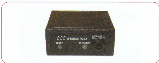
3M™ Continuous Monitor, Single Wire 2