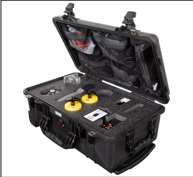
Figure 1. SCS 770129 ESD Compliance Verification Kit