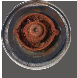
Without VpCI®-705 Bio

Dosage: 1.5 oz. per 10 U.S. gallons tank volume (45 mL per 37 liters of tank volume).